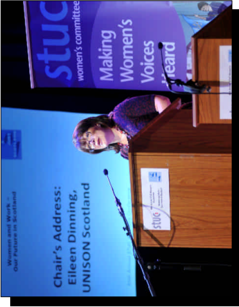
JOURNAL OF THE NATIONAL ASSEMBLY OF WOMEN 50P WINTER 2013